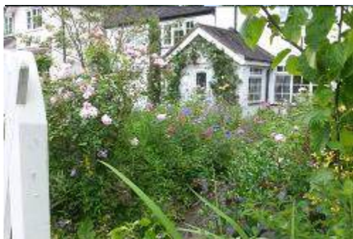
Highly Commended - Cross Lane