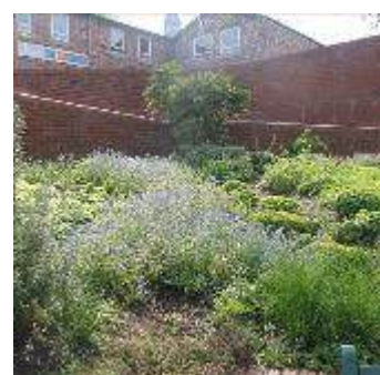
Capitol Walk bed—all year around colour