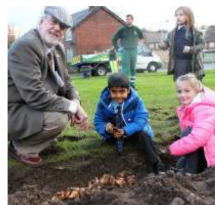
Bulb planting—Mayor looks on