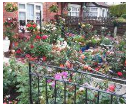
Highly Commended Kingsley Street