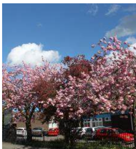
Spring Blossom - St Mary's School