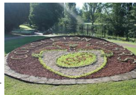
Formal Plaque in celebration of the World Cup Rugby 2015