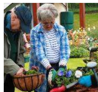
Planting up baskets