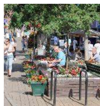
Greening the Town Centre for shoppers