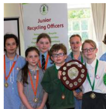
Junior Recycling Officers – winners!