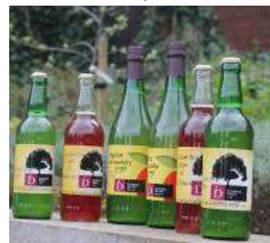
Congleton Apple Juice and Congleton Cider