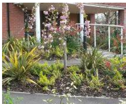
McCarthy Stone Retirement home