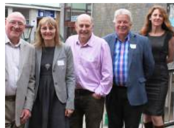
Sharing information with SW in Bloom