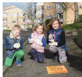
No Dog Fouling signs added to pavement