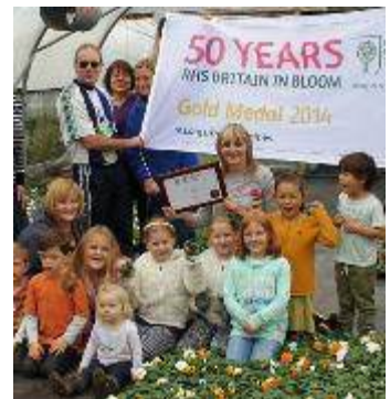
Celebrating GOLD at Britain in Bloom