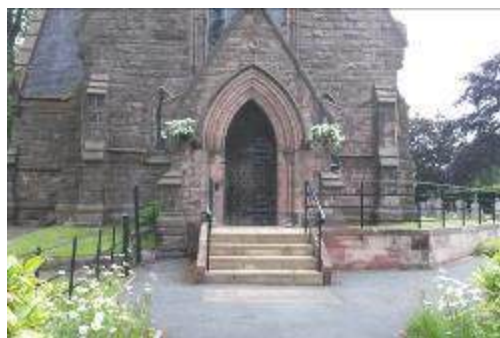
CHURCH—Mossley Holy Trinity