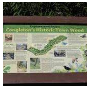
Town Wood Interpretation Signs