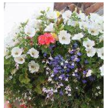
240 Hanging Baskets sponsored by companies