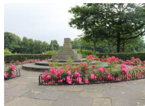
St Peters Church