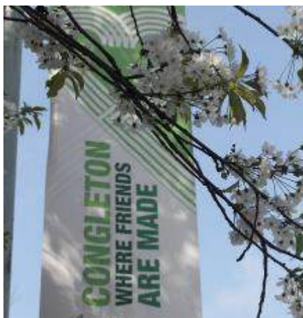
Blossom and Flags—Mountbatten Way