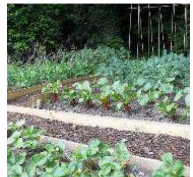
New Community Allotment in the Park