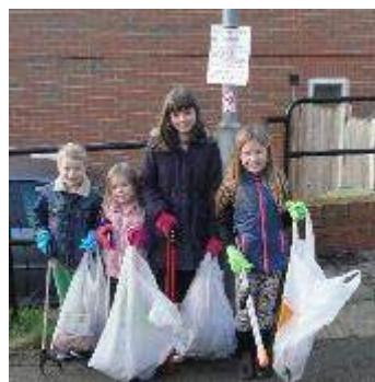
Cleaning up our neighbourhoods