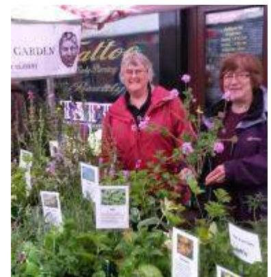
In Bloom at Food and