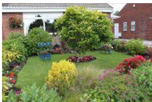
Highly Commended Lower Heath