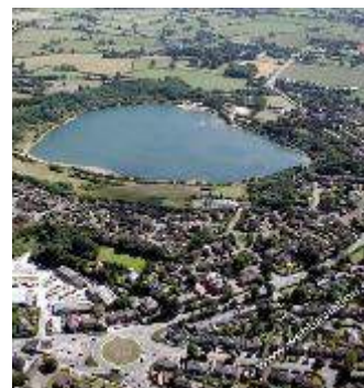
Ariel Shot of Astbury Mere

Wildflower Meadows - Congleton Rotary has sponsored a wildflower meadow in the park at the site of the annual Rotary Bonfire for 4 years. There are also wildflower meadows at the Mere, and at many of the schools.