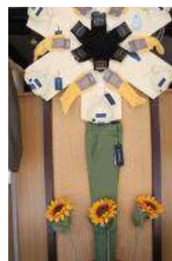
Davenports Window Display