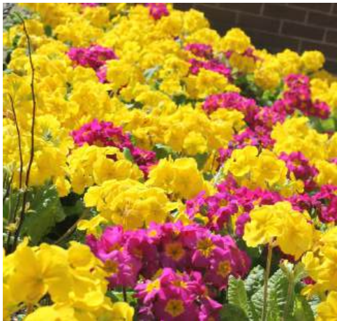
Spring Bedding Plants—Town Centre