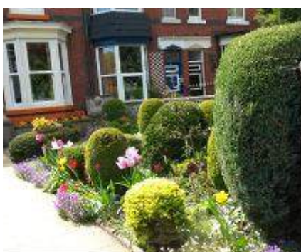
Highly Commended Park Road