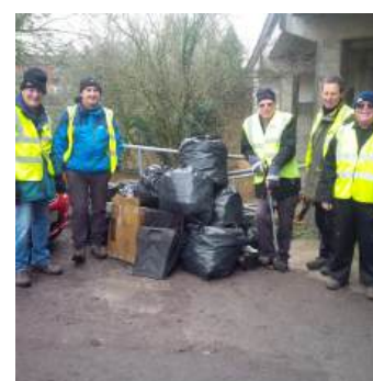
Railway and Canal Working Parties collecting litter