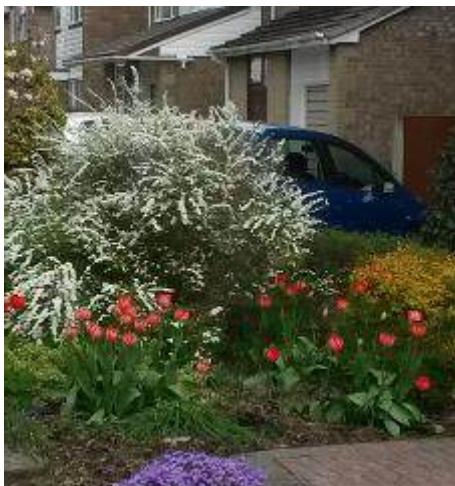
Spring entry—Favourite Front Gardens