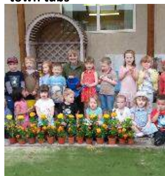
Pre-school children growing flowers