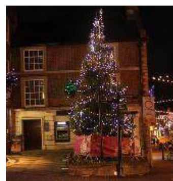
Recycled over 120 Christmas Trees