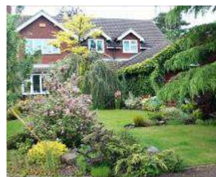
Highly Commended Cedar Court