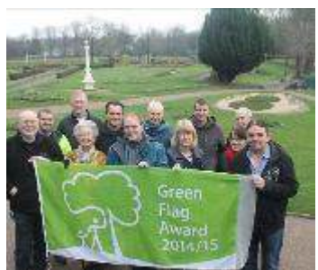
Another Green Flag for the Park