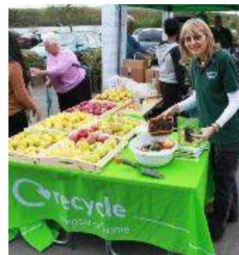
Seed Swaps—Astbury Mere Oct 14 and May 2015