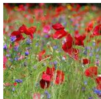
Wildflower Meadow looks best in August