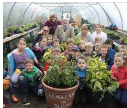
School Children plant town tubs

Favourite Front Gardens —The public have been encouraged to nominate their favourite front gardens. Publicity is given to those entering – resulting in greater competition in some areas of town!