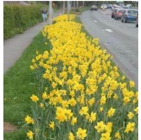
New Daffodils—Clayton Bypass