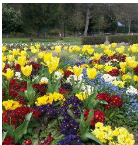
Spring Congleton Park