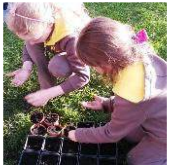
Planting up WHERE WHAT WHEN?