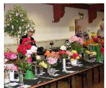
Horticultural Show— Town Hall Sept 2014