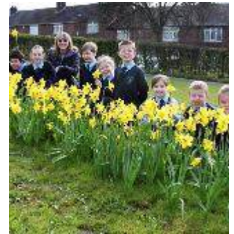
Children admire 'their' daffodils

July : Deadheading, weeding, watering, litter picking. Enjoying the Green spaces and North West in Bloom judging Taking tremendous trees, bears and tubs to RHS Tatton. LOL ex-soldiers also displaying a 'defiant trench allotment' which has been grown in the polytunnels and will be displayed in Congleton after the RHS Show (21-24 July)