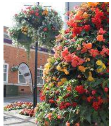
Town Centre Flower— pedestrian area

The Town Council works closely with the local Four Oaks nursery and Cheshire East's Ansa section. Plants are grown at the nursery and delivered to the Town Council poly tunnels for planting out.