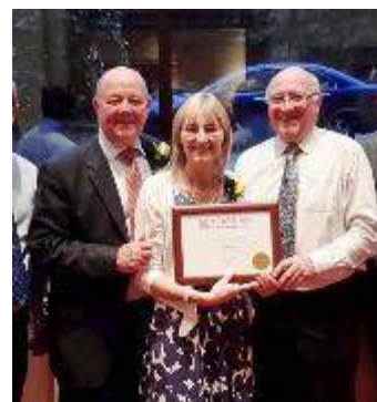
Collecting Gold Medal from Britain in Bloom 2014

January & February: Held In Bloom thank you and support for 2015 event at the Town Hall. Finalised Town Centre spring planting scheme and order plants. Gardeners changed some of the planting shapes in the park (10 year Heritage commitment finished). Added height to plant beds. Campaign to reduce dog fouling launched. Winter maintenance programme includes pruning trees, hedges and shrubs. Member of In Bloom team invited by Britain in Bloom to share experiences at SW in Bloom regional training sessions.