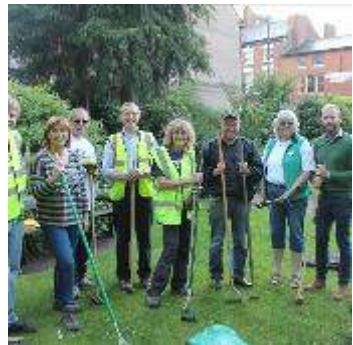
Back breaking removal of weeds—heritage path