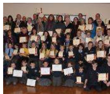
So many people to thank for their help and support