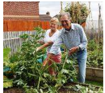
Getting to grips with allotments