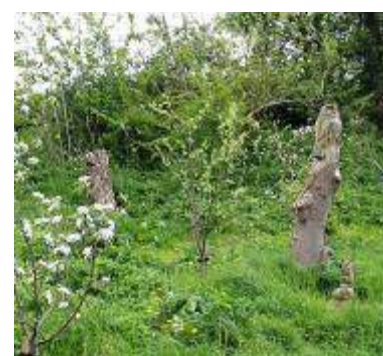
Community Orchard in Bloom