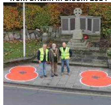
Pavement Poppies at Cenotaph