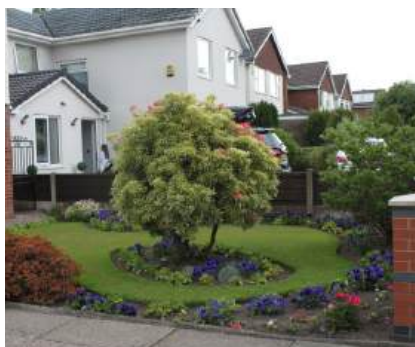
Highly Commended Longsdale