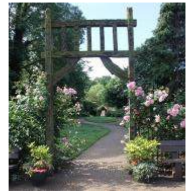
Community Gardens— now est. 20 years

Congleton and District Horticultural Society —49 years old! Record entries at Annual Show in the Town Hall in September 2014—140 categories. Under 16s enter free