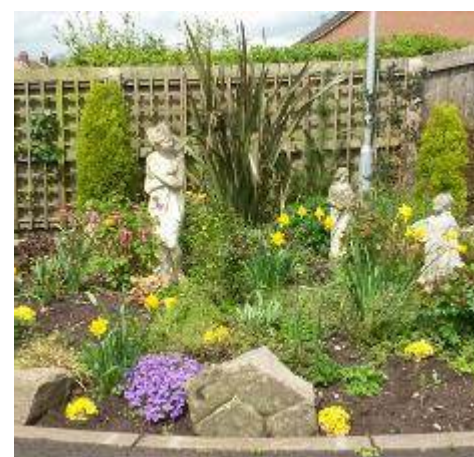
Spring Planting—Heath View