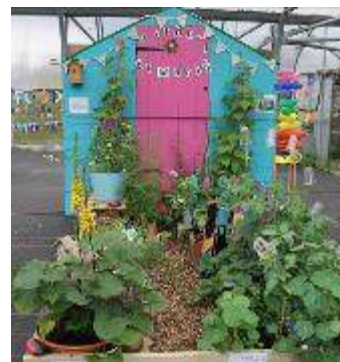
Back2Back school gardens in Polytunnel

In Autumn 2012 Lime Trees were planted on the A34 and in the Park. This is planning ahead so that the trees can be established before older deceased trees needs to come down.