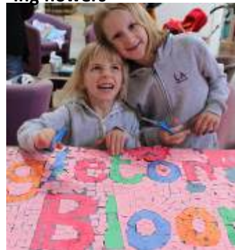
Community Workshops June 2015