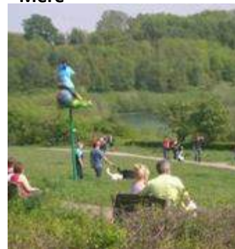
At Astbury Mere