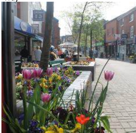
Spring Bedding —Town Centre