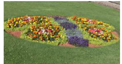
Butterfly in the Park