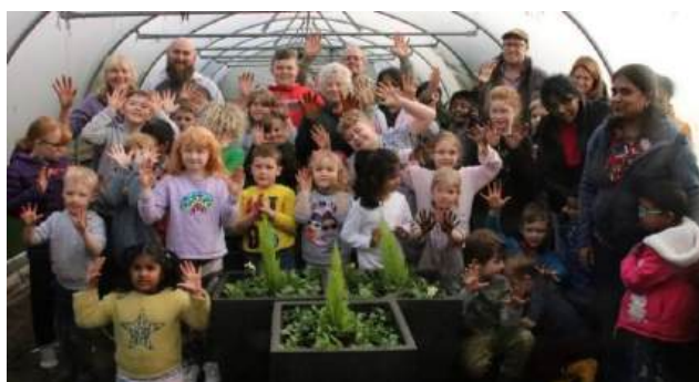
Children's Autumn tub plant-up