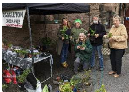
Seed Swap at URC