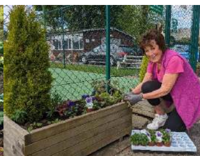
IYN Tennis Club