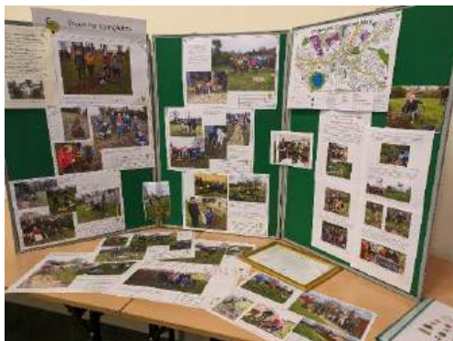
East Cheshire Tree Alliance conference and meet the farmers making a difference

Over 40 attended the inaugural meeting in Congleton Town Hall, with representatives from 10 towns and villages all with an interest in more trees in Cheshire East.