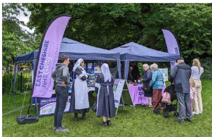
Special party in Congleton Park to celebrate the centenary of Congleton War Memorial Hospital