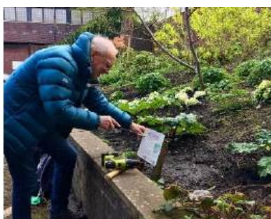
Adding signs at the fairground