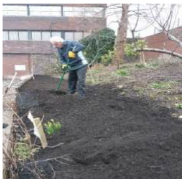
Spreading Biowise at the Fairground garden