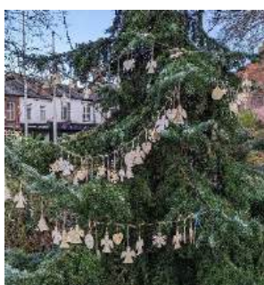
Rotary 'Tree of Light' at the Community Garden