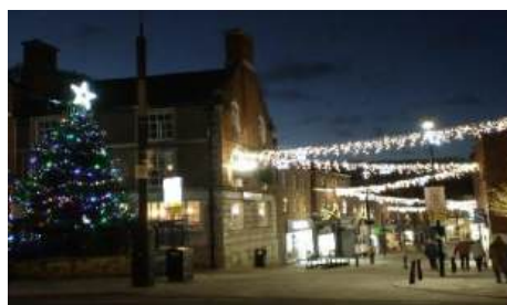
Christmas trees through the town centre