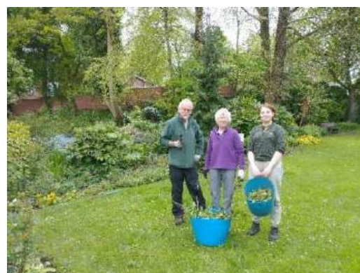
IYN Friends of the Community Garden