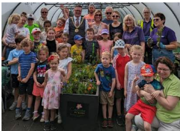
IYN BHPG spring open day

Kid's tubs planted; winter bedding removed, primulas distributed to schools, care homes, etc.