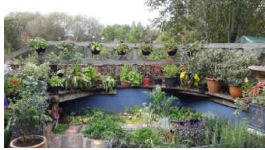
The Secret Garden created by volunteers back in 2016

Climate change: Congleton takes its commitment to the environment seriously. In autumn 2019, Congleton Town Council declared a climate emergency and set up Congleton Green Group and commissioned the Biodiversity Action Plan featuring 30 sites around the town.