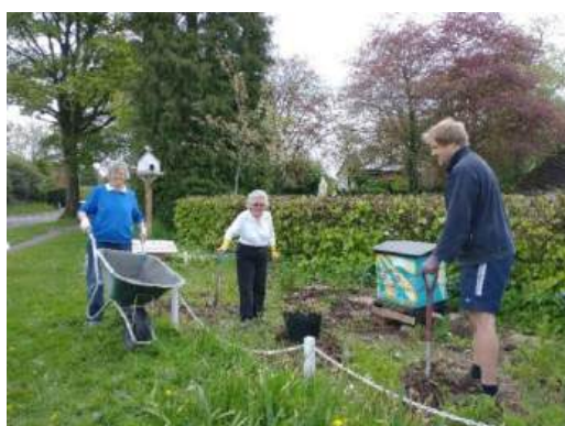
IYN Buglawton in Bloom