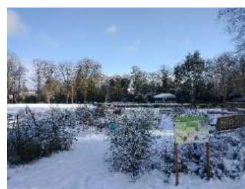
A snowy Just Bee Garden