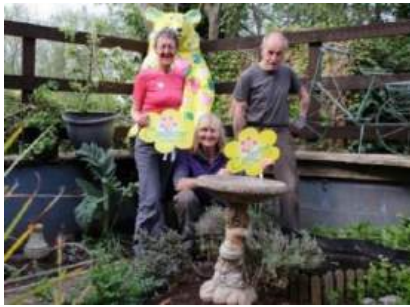
Volunteers working at the Secret Garden