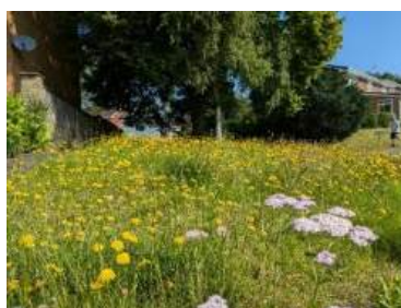
Low Mow May Town grass verge