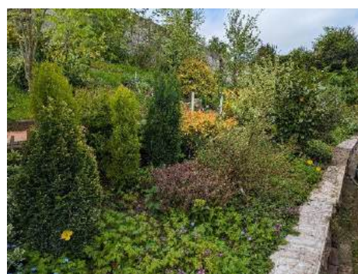
IYN The Wednesday Club