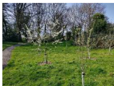
Apple, Plum and Pear trees in blossom