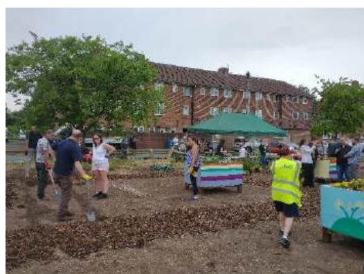
IYN Bromley Bloomers