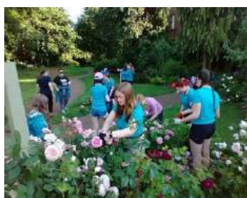
Rangers helping out at the Community Garden