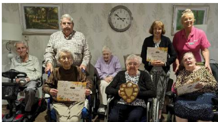
Clayton Manor residents with their Wheelbarrow Challenge award