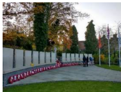
The Cenotaph, Remembrance Sunday