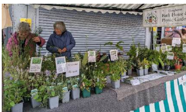
Displays by two IYNs at Congleton Food Festival