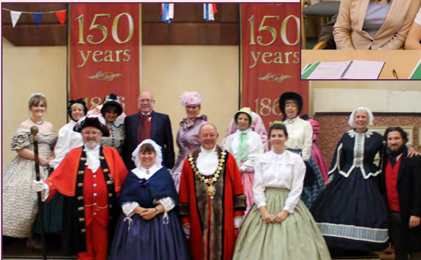
Celebrating 150 Years of Congleton Town Hall