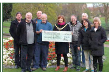
Friends of Congleton Park