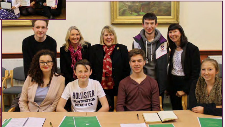
Congleton Youth Council