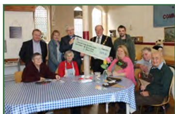
Congleton United Reformed Church