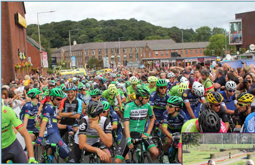
Cyclists on the start line at the Tour of Britain Cycle Race