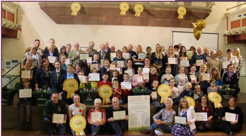
Congleton In Bloom Celebration Evening