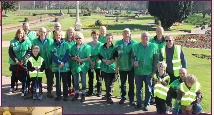
Congleton's Big Spring Clean Volunteers