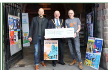
Congleton Unplugged Festival