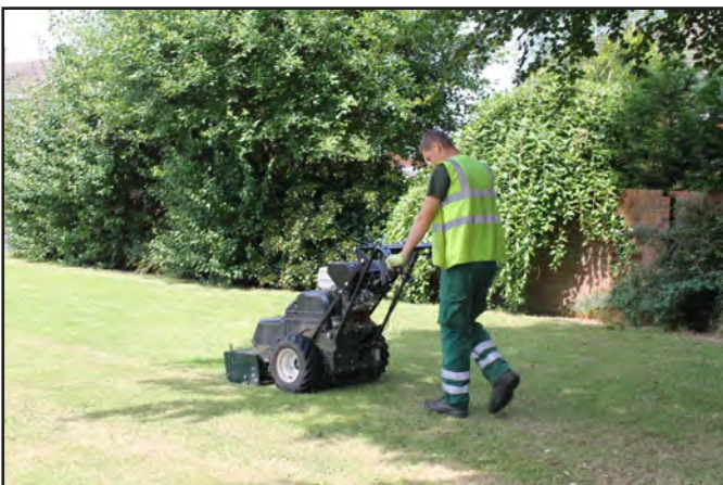
“Streetscape in Action”