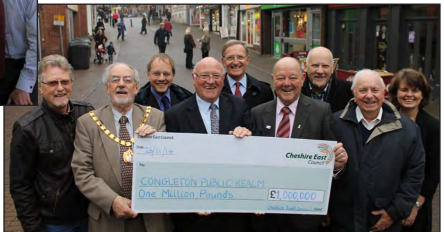
Congleton Public Realm - Cheque for £1 million