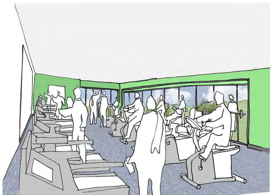
Artist's impression of how the Fitness Suite could potentially look