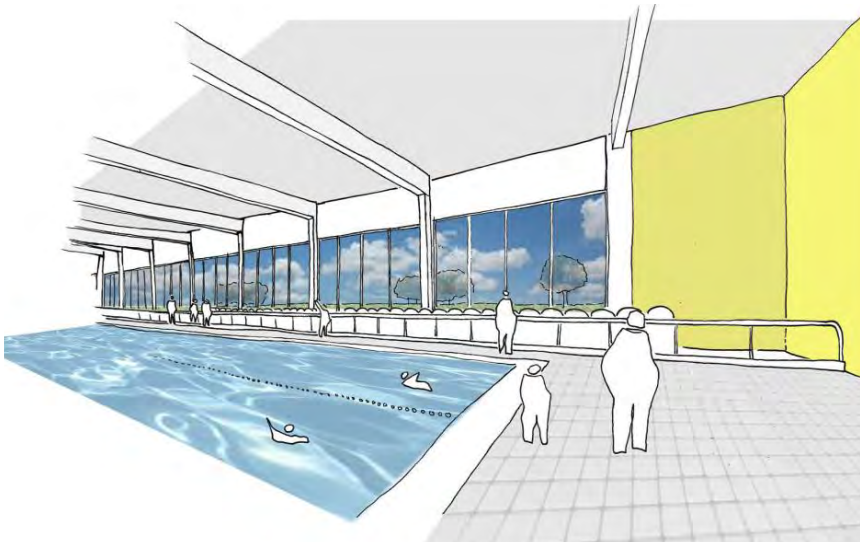
Artist's impression of how the Swimming Pool could potentially look