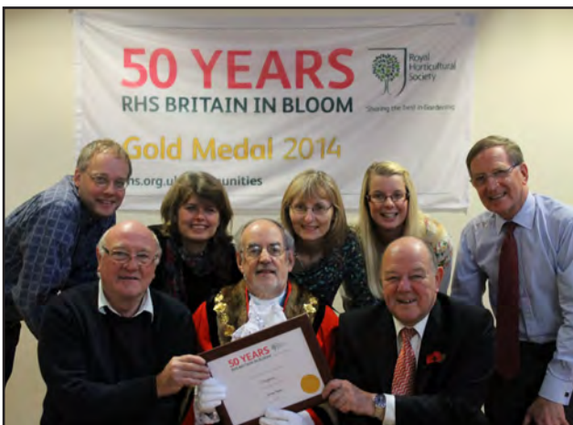
In Bloom Winners 2014