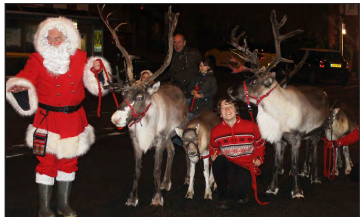
Reindeers at the Christmas Light Switch On