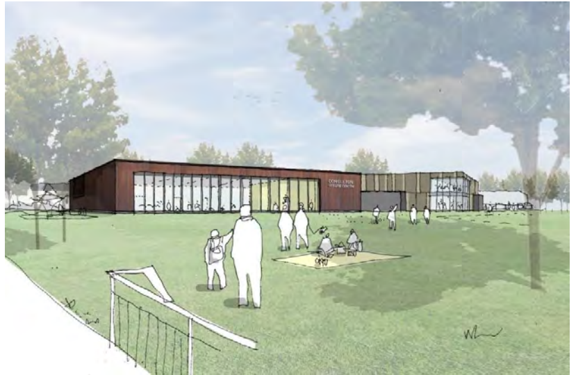
Artist's impression of how the Leisure Centre could potentially look like when viewed from Hankinson's Field